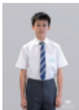
中学男 Secondary Boys