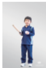
小学女 Primary Girls