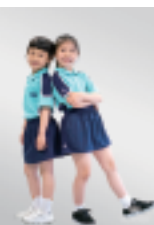
小学女 Primary Girls