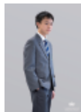
中学男 Secondary Boys