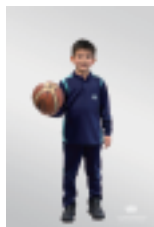
小学男 Primary Boys