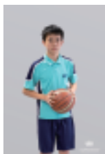
小学男 Primary Boys