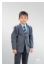
小学男 Primary Boys