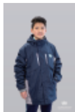
中学男 Secondary Boys