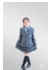
小学女 Primary Girls