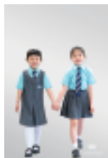
小学女 Primary Girls